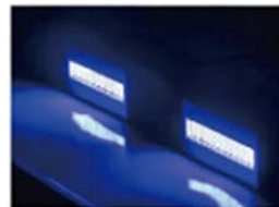
LED水冷固化灯 LED UV water- cooling Lamp