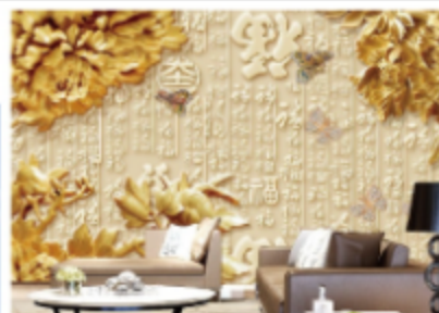
竹木纤维板 Bamboo fiberboard