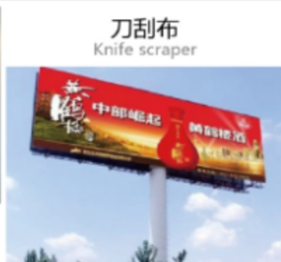
刀刮布 Knife scraper