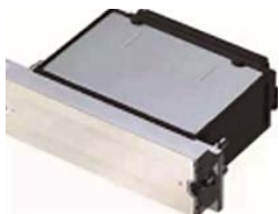
理光G6工业喷头 Ricoh Gen6 Printhead