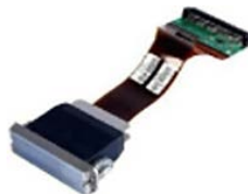
理光G5工业喷头 Ricoh Gen5 printhead