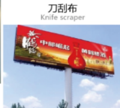
刀刮布 Knife scraper