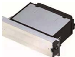
理光G6工业喷头 Ricoh Gen6 Printhead