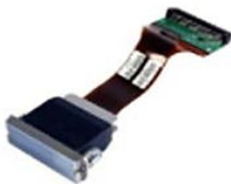
理光G5工业喷头 Ricoh Gen5 printhead