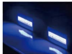
LED水冷固化灯 LED UV water- cooling Lamp