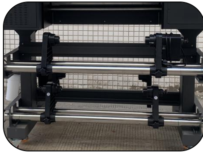
Automatic Media Feeding