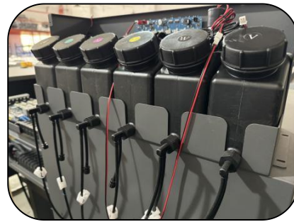
Ink Tanks well displayed