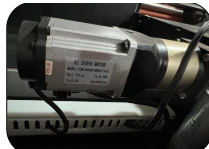
Leadshine Servo Motor