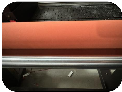
Integrated upper and lower rollers for film laminating